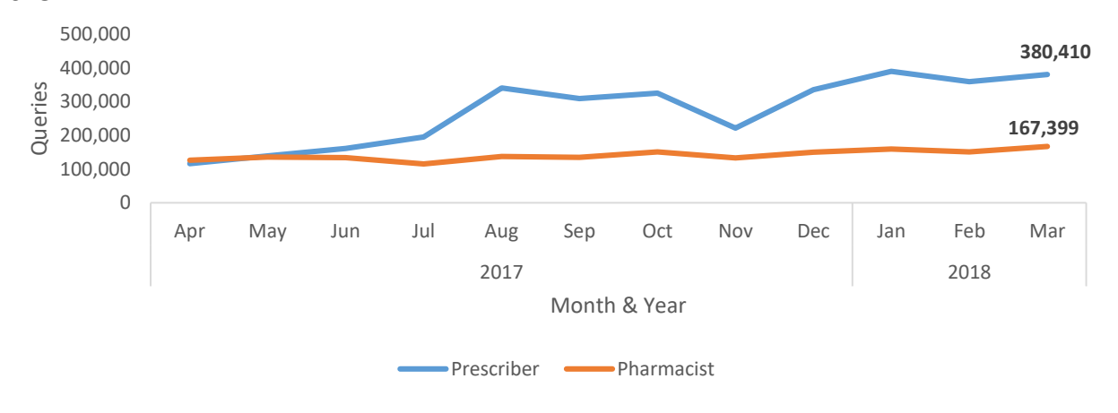
Figure 2: Number of queries by prescribers and pharmacists – Arkansas – April 2017 – March 2018

Along with the increase in registered PDMP users, the number of queries made to the PDMP has also grown. The number of queries made by pharmacists reached an all-time high of 167,399 in March 2018. During that same month, prescribers queried the PDMP 380,410 times, a number that remained relatively steady during the first three months of 2018.